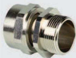
ISO straight fitting, fixed, male, nickel plated brass.