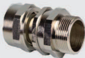
ISO straight fitting, swivel, male, nickel plated brass.