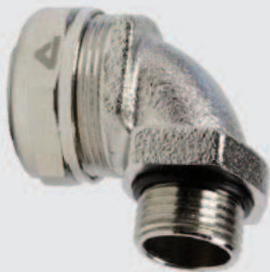
ISO 90° fitting, compact, male, nickel plated brass (including connection set).