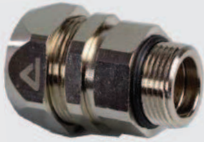
ISO straight swivel fitting, male, nickel plated brass, IP 65 / IP 67 (including connection set).