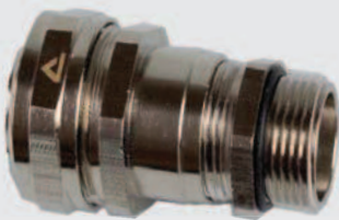
ISO cable-hose fitting, compact, male, nickel plated brass, double seal according EN 45545-2, HL 1 / HL 2 / HL 3, table R22 and R23 (incl. connection set).