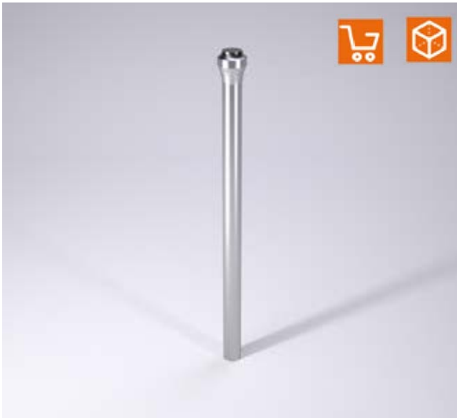
2284.3. 带喇叭颈的冲头, DIN 5118 A 型