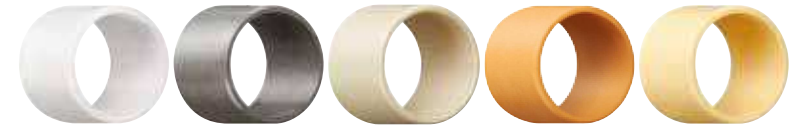
Dimensions sleeve Abmessungen zylindrisch [inch]