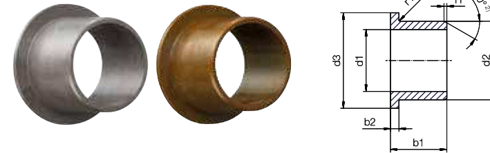
Dimensions with flange Abmessungen mit Bund [inch]