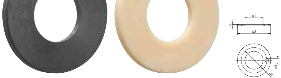
Dimensions thrust washer Abmessungen Anlaufscheiben [mm]