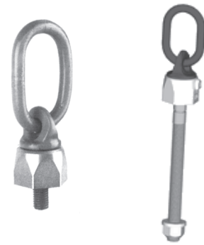
Lifting points bolted WBG-V/WBG

This safety instruction/declaration of the manufacturer has to be kept on file for the whole lifetime of the product. Translation of the Original instructions