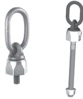
Lifting points bolted WBG-V/WBG

This safety instruction/declaration of the manufacturer has to be kept on file for the whole lifetime of the product. Translation of the Original instructions